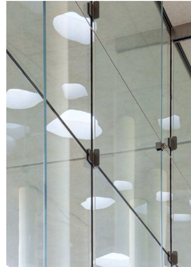
School of Medicine - University of Montpellier