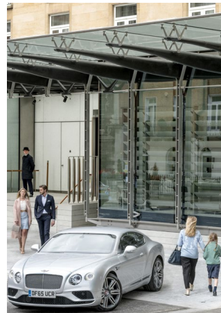
The Berkeley Hotel